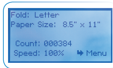
Large LCD Screen